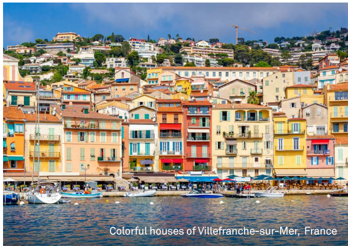
Colorful houses of Villefranche-sur-Mer, France

The itinerary is a guide only and may be amended for operational reasons. As such Mayflower & Scenic cannot guarantee the tour will operate unaltered from the itinerary stated above. Please refer to our terms and conditions for further information.