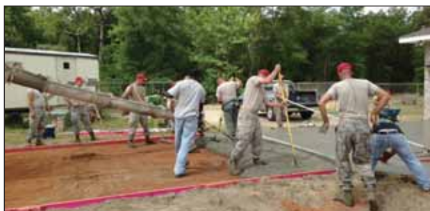
Red Horse volunteers work on the driveway of the CIC Ya Ya's House family foster home in the Children's Neighborhood.