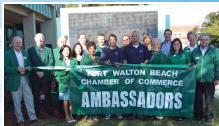
Gulf Coast Detailers 149 Scottwood Dr SE Fort Walton Beach, FL 32548