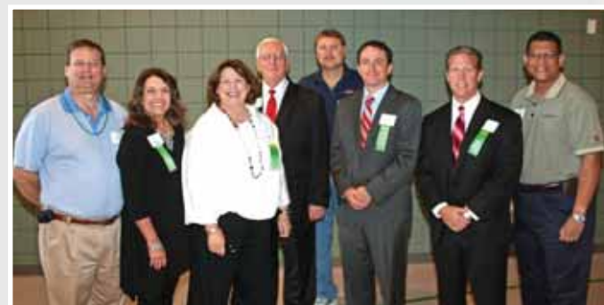
We love our new members!