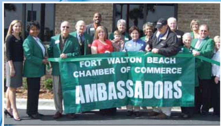
Zaxby's 106 Eglin Parkway, NE Fort Walton Beach, FL 32548