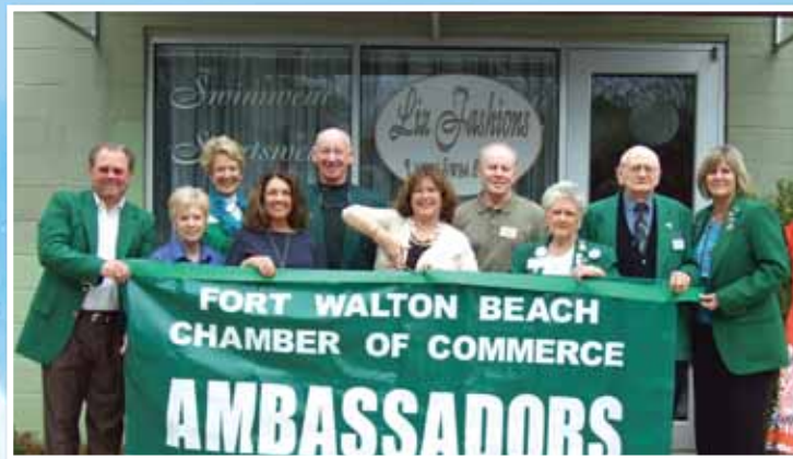
Liz Fashions 184 Miracle Strip Parkway, SE, Suite 2 Fort Walton Beach, FL 32548