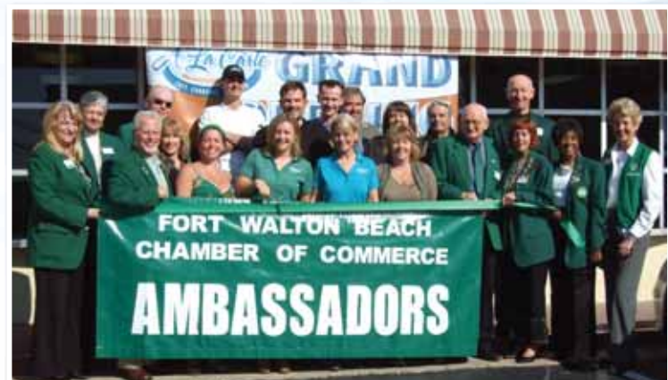
A La Carte Café, Carryout, and Catering 99 Eglin Parkway, NE, Suite 34 Fort Walton Beach, FL 32548