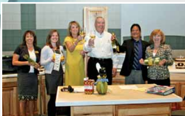
Our sponsors from the Daily News showed us what to expect from the upcoming Relish Cooking Show.